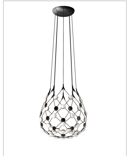
D86C551 weight 2,7 Kg

Reference code: Structure D86C551 1D860C551001 black D86C555 1D860C555001 black